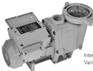
IntelliFlo® VS+SVRS Variable Speed Pump

Download our FREE White Paper Report . In the Insider's Guide to Reducing Pool Energy Consumption , you'll see the huge difference the right equipment can make. Go to www.pentairpool.com/yourguide . Or visit Barto Pool and Spa to start saving today.